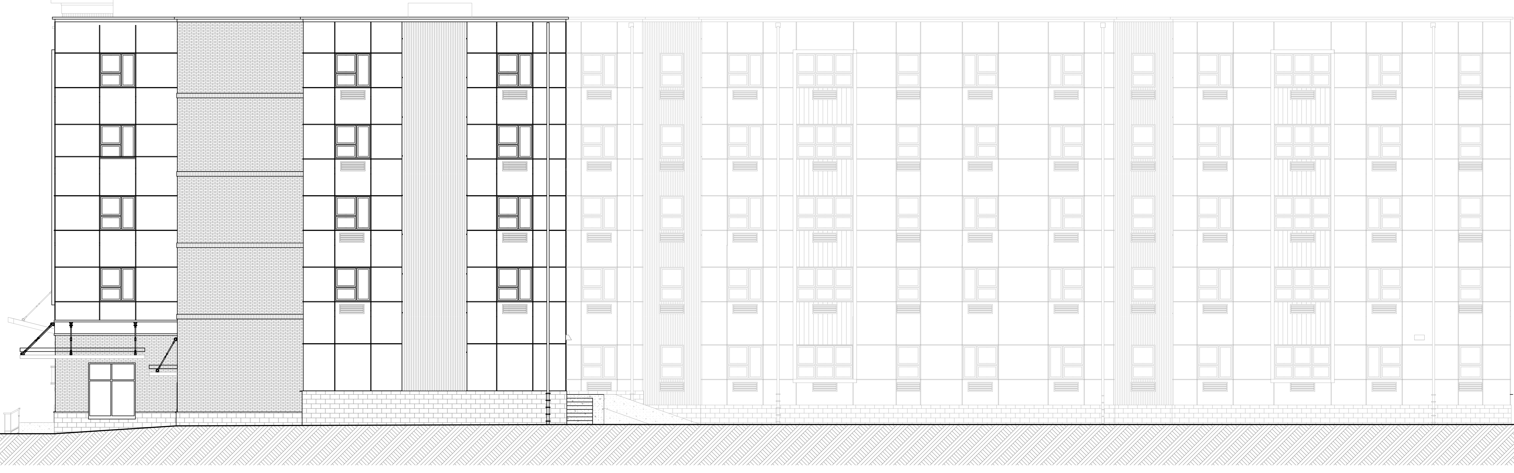
2 NORTH ELEVATION SCALE: 1/8" = 1'-0"

RESIDENTIAL FIRST FLOOR AT MITCHELL STREET 0'-0"