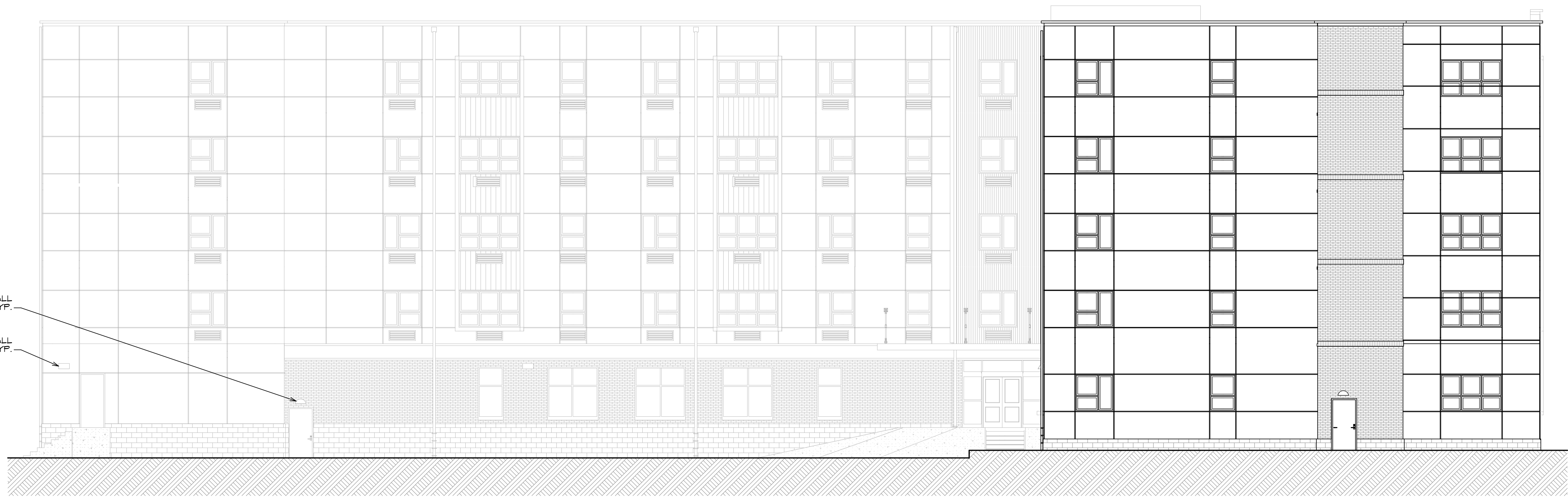
1 WEST ELEVATION (MITCHELL STREET) SCALE: 1/8" = 1'-0"

EXTERIOR WALL LIGHT, TYP. EXTERIOR WALL PACK LIGHT, TYP.